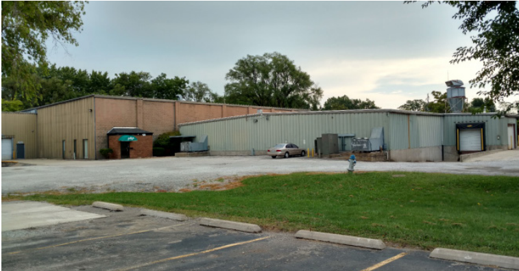
Building "A" & "B"