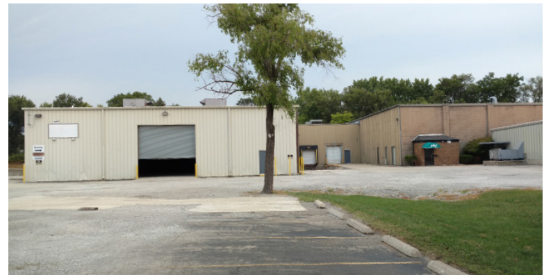
Building "D" Overhead Door