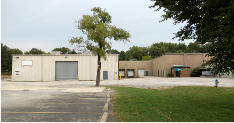
Building "D" & Building "C" Loading Docks