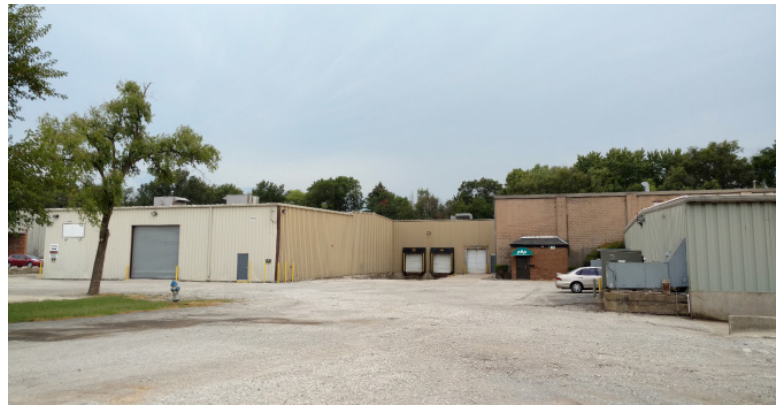
Buildings "A", "B", "C" and "D"